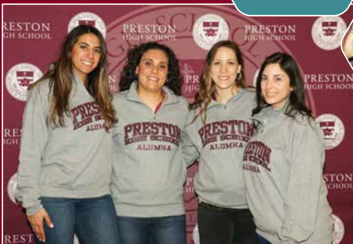
Class of 2007